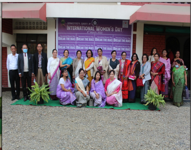
International Women's Day, 2022 observance at Rotary Club Convention in collaboration with Thambal Marik College, Oinam