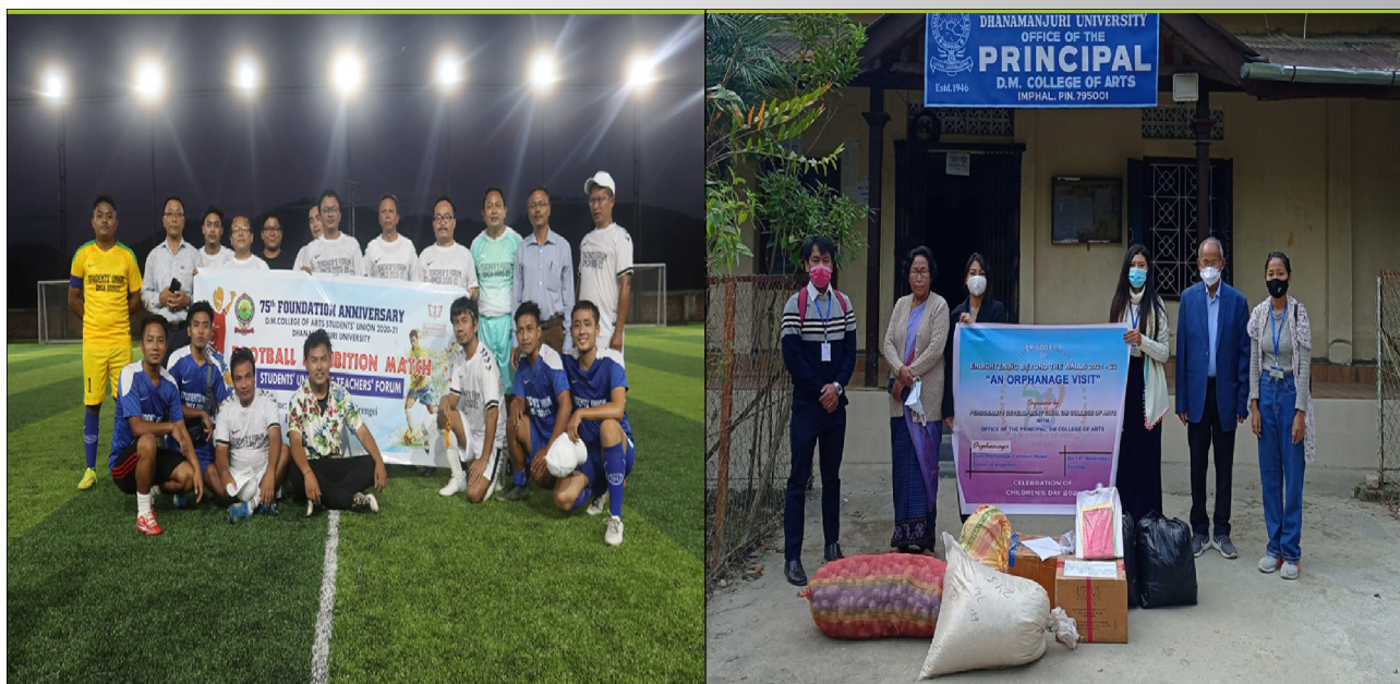
Football Exhibition match