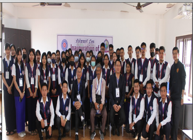
Inauguration of NSS Special Camp, 2022