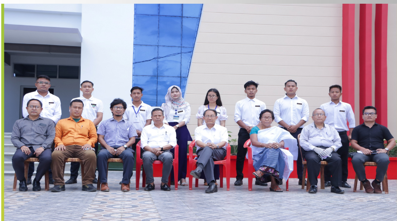
Students' Union Election,2020-21