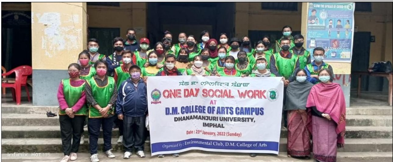
One day Social work organized by Environmental Club