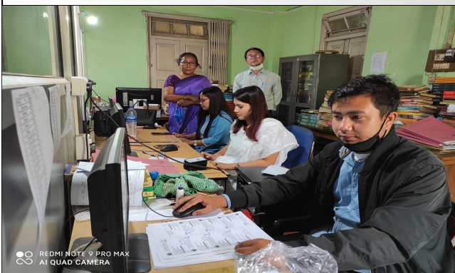
Full Automation of the general library of D.M.College of Arts,Imphal