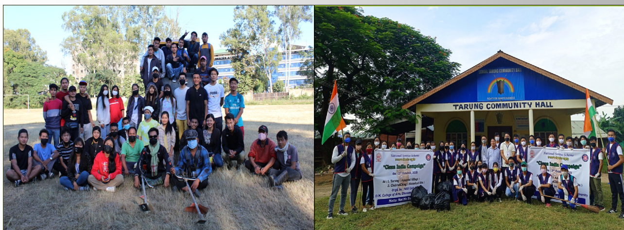
Social Service in DMU Campus