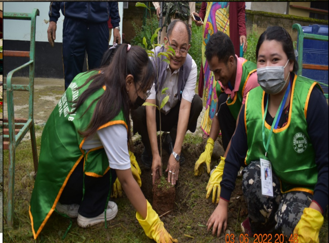
Prof.N.Rajmuhon, VC, DMU planting trees in DMCA Campus on World Environment Day,2022