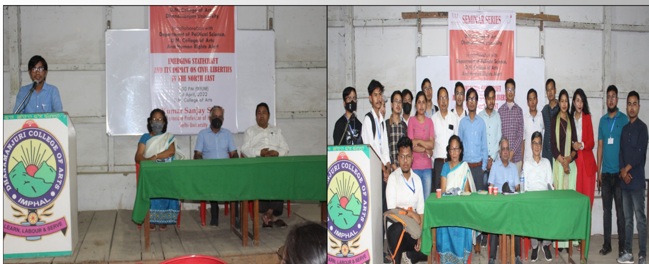
Seminar Series of Political Science Department