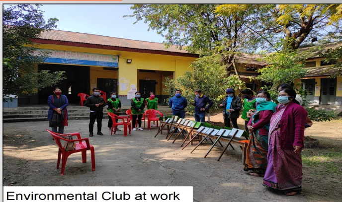
Environmental Club at work

The College has been actively engaged in a sustained effort for environmental improvement in the form of the Go Green & Clean campaign spearheaded by the club. For a healthier environment the club undertakes various ' Green ' activities within the larger perspective of Swachh Bharat Abhiyan .