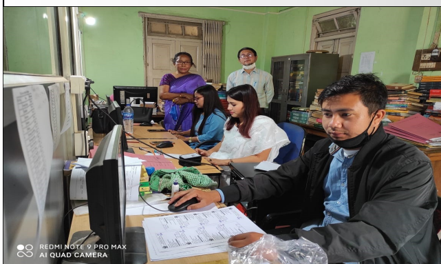
Full Automation of the general library of D.M.College of Arts,Imphal